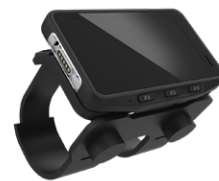
Fig. 1 The CW45 Rugged Wearable Mobile Computer

purposefully designed to withstand today's warehouse environments while increasing overall workflow productivity. At the same time, it must be easy to use and comfortable enough to wear all day, every day. They need a solution that is going to improve the overall productivity of what has become a highly mobile workforce, eliminate wasted time and energy renewing consumer-based devices, and lower their total cost of ownership while increasing their topline revenues.